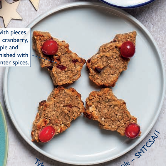
Tyke Cranberry & Spiced Apple – SMTCSA/I

Adorned with pieces of ruby red cranberry, juicy apple and delicately finished with warming winter spices.