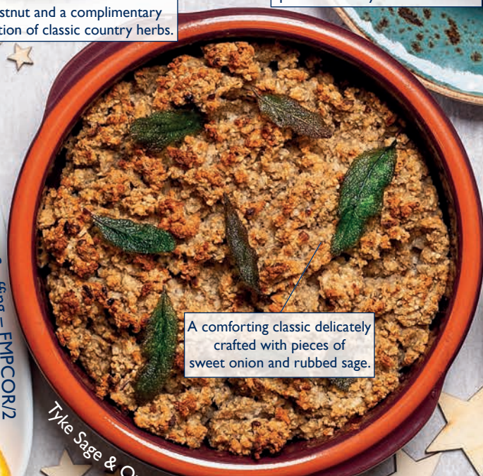
Tyke Sage & Onion Stuffing – SMTSO/I

A fruity little number bursting with sweet seasonal chopped fruit and finished with a sprinkling of rubbed parsley.