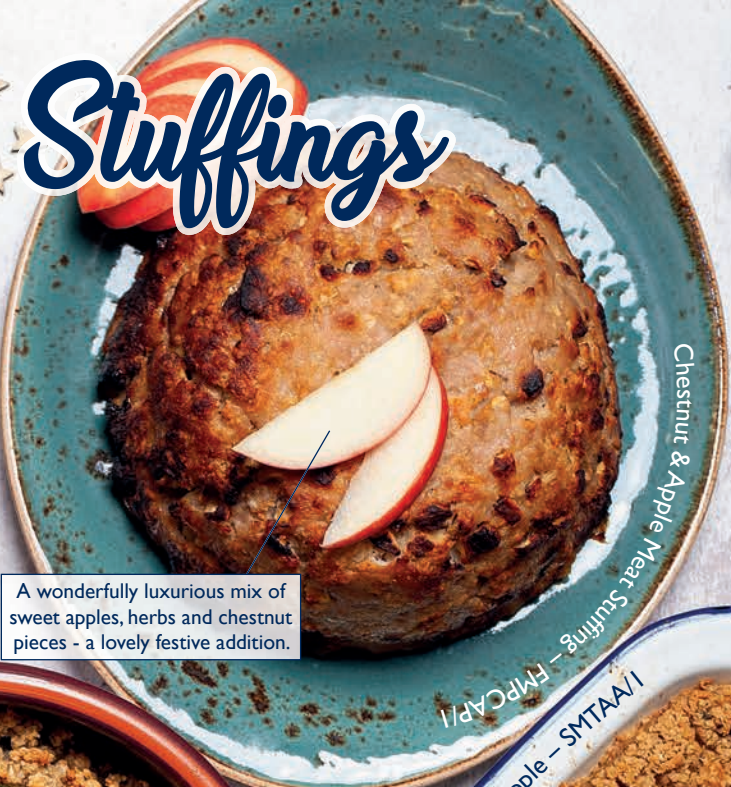
Chestnut & Apple Meat Stuffing – FMPCAP/I

A dream for those who love stuffing, this wholesome blend contains rustic nibs of chestnut and a complimentary selection of classic country herbs.