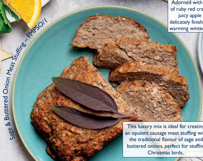
Sage & Buttered Onion Meat Stuffing – FMPSO/I

A match made in heaven, this warming blend contains pieces of diced apple, sweet golden apricots and a selection of mixed herbs.