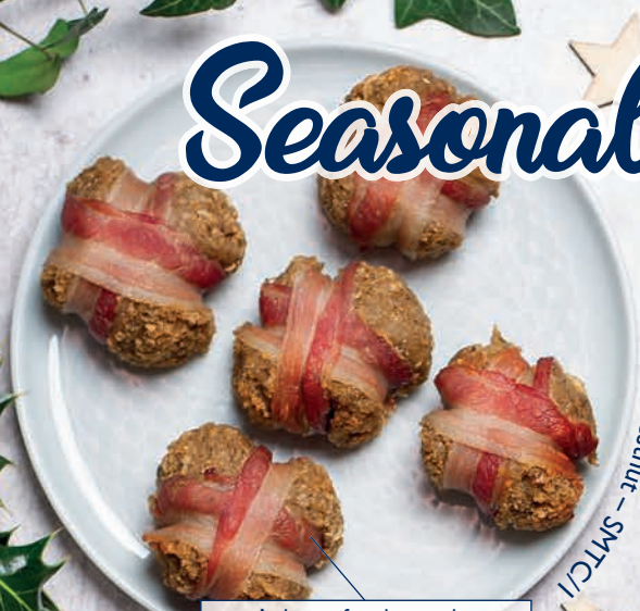
Tyke Chestnut – SMTCI/I

A dream for those who love stuffing, this wholesome blend contains rustic nibs of chestnut and a complimentary selection of classic country herbs.