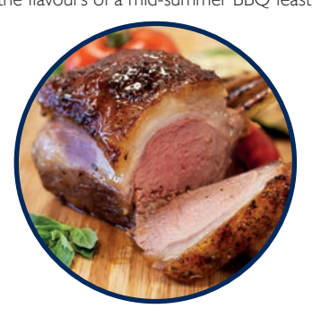
GARDEN MINT - DG104

The mouth-watering flavour of garlic butter combined with a sprinkling of parsley and enhanced with white onion.