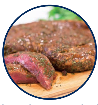
CHIMICHURRI - DG113

The aromatic delight of Thai flavour, featuring distinct lemongrass, smooth coconut flavour, a subtle zing of chilli and a sprinkle of coriander.