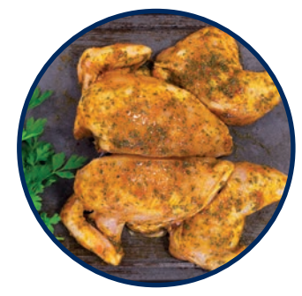
GARLIC BUTTER - DG103

A true taste of the orient, this sweet and spicy glaze blends the sweet flavour of garlic with a pinch of ginger and enticing star anise.