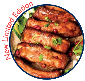
COLA & MOLASSES - DG117

The nostalgic flavour of cola and the deep richness of molasses combine to create this lip-smacking glaze that's sure to be a hit!