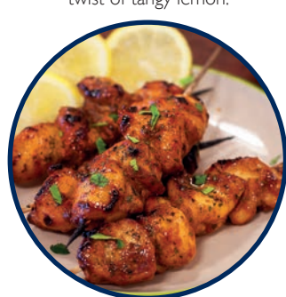
TIKKA - DGI 10

A tangy blend of sweet chilli and red pepper accentuated with fresh flavours of garlic, onion and a sprinkling of herbs.