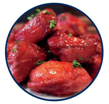
CHINESE - DG 102

A true taste of the orient, this sweet and spicy glaze blends the sweet flavour of garlic with a pinch of ginger and enticing star anise.