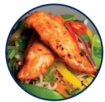
SWEET CHILLI - DG109

A classic combination done superbly well, made with the finest salt and rugged black pepper, featuring subtle notes of fennel and sweet garlic.