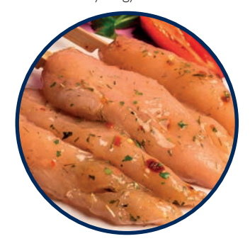
THAI - DGI 15

A Mexican wave of flavour with Chipotle chilli heightened by zingy lime.